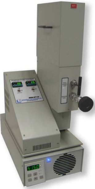
Figure 1: SFT-110 SFE

pressure vessel (10kpsi, 200°C operation). Seal the vessel and set into a SFT-110 SFE unit. Position a preweighed SFT collection vial on the outlet of the restrictor valve flow line. Extract the sample according to the following parameters: