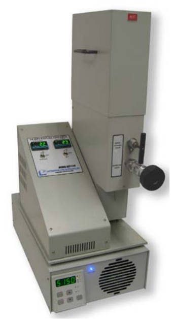
Figure 1: SFT-110 SFE